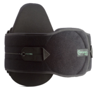
Evergreen 631 LSO LoPro Additional support Back panel Code L0631 approved