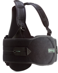
Evergreen 456 TLSO Independent upper and lower tightening Four to one mechanical advantage Code L0456 approved