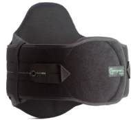
Evergreen 637 LSO Supportive side panels Back panel Code L0637 approved